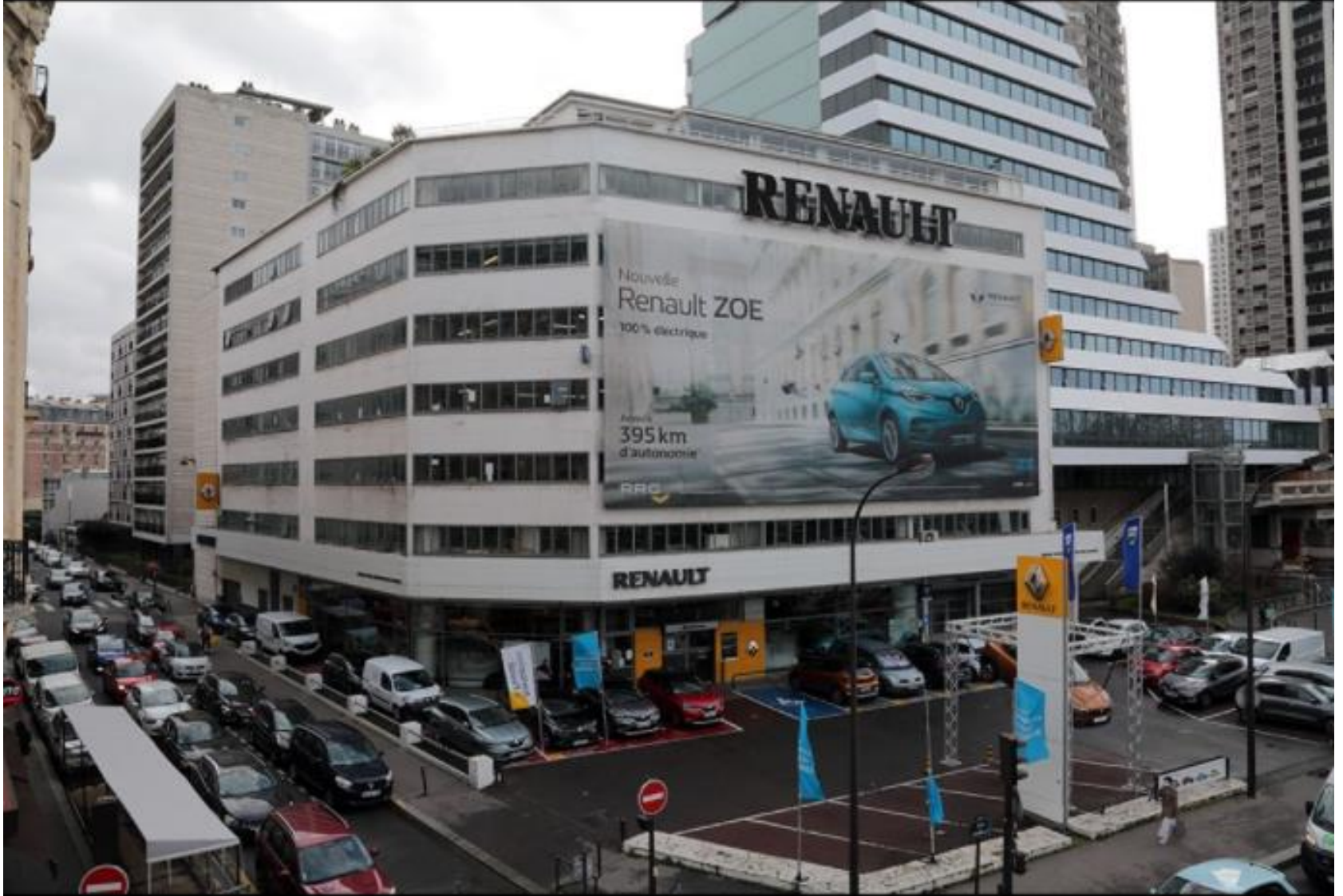
Renault garage, 29 quai de Grenelle (15th arrondissement)