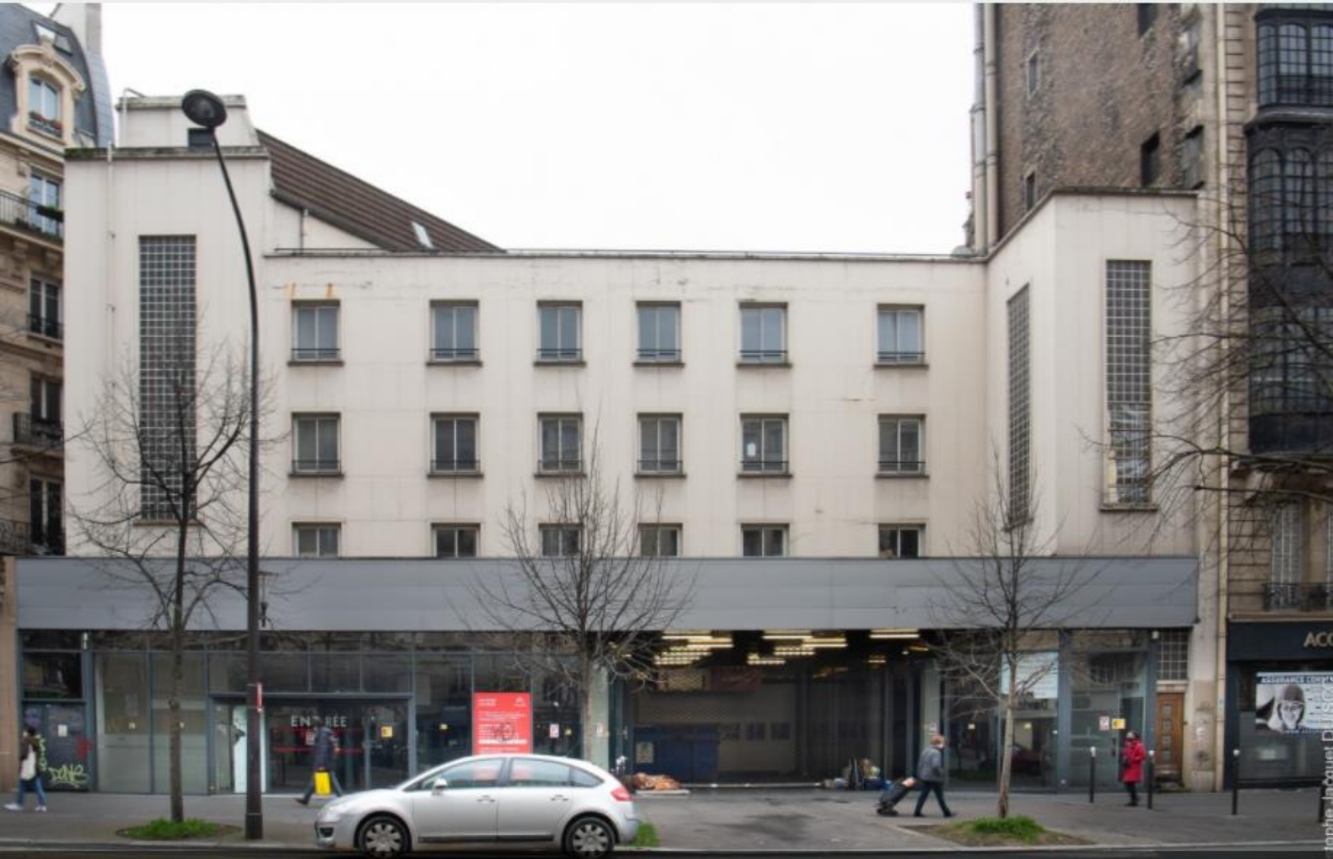
PSA RETAIL garage, 62 avenue de la République (11th arrondissement)